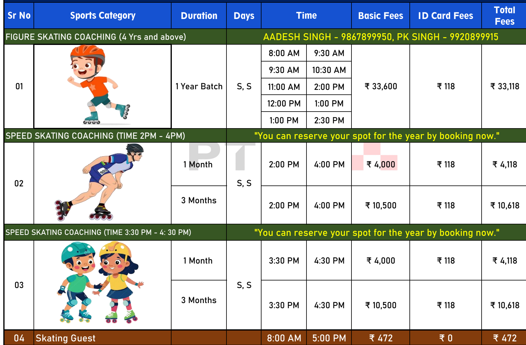
FIGURE & SPEED SKATING